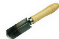
Corner Chisel ITEMCODE : SA 1111